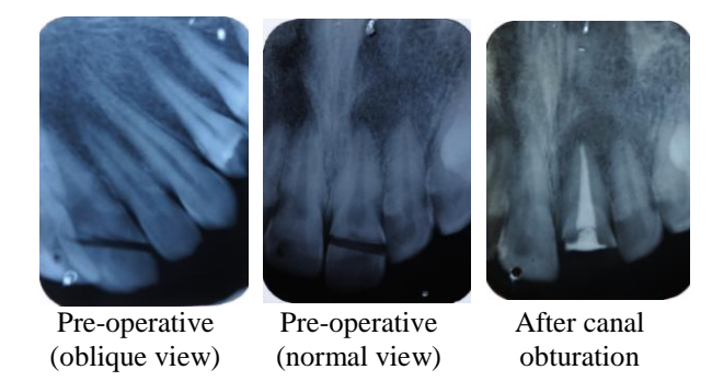
Figure 2: Pre-operative Per-operative Radiograph