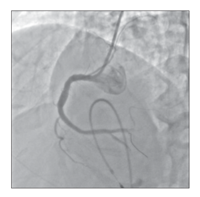
Fig.-2: After thrombus suction and stenting of RCA in same patient.

Performa was designed to collect information including age, gender, history of diabetes (defined as a fasting glucose ≥126mg/dl or on treatment), hypertension BP \geq 140/90mm Hg or on treatment), dyslipidaemia (fasting total cholesterol ≥200mg/dl or on treatment), smoking, left ventricular function (visually estimated using echocardiography), presence of cardiogenic shock (defined as systolic blood pressure <90mm or requirement of inotropes to maintain a SBP > 90mm of Hg) angiographic and procedural details (culprit vessel, number of diseased vessels, use of stents, GP llb/llla inhibitors, Thrombolysis in myocardial infarction (TIMI) flow were also collected. Hospital charts were reviewed for further information including need for intubation, electrocardiogram (ECG) ST-segment analysis and laboratory data including haemoglobin, serum creatinine, cardiac enzymes etc. Timing variables were computed including time to presentation which is defined as the time from symptom onset until arrival at the hospital. Door-to-balloon time was the time from arrival at the hospital until balloon inflation in cardiac catheterization laboratory.