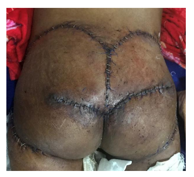
Fig. 3. Preoperative appearance of a sizeable sacral sore. ( above ) The appearance of the reconstructed gluteal region per operative pictures. ( below ) Reconstructed by Bilateral V-Y Rotation Advancement flap.

As our experience and other reports demonstrate, various modifications of the