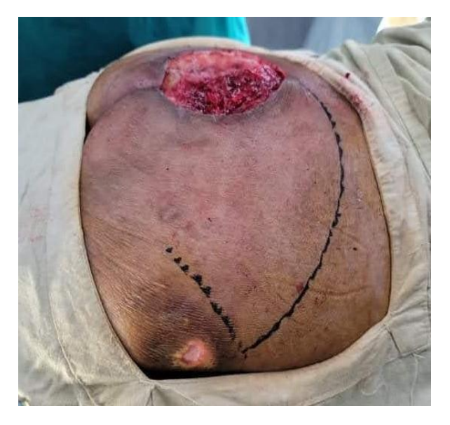
Fig. 2. Preoperative appearance of a sacral pressure sore. A wide surgical wound is created after debridement. (above) The appearance of the reconstructed gluteal region per-operative pictures. (below). Unilateral Flap coverage. Crescent-shaped, fascio- cutaneous flaps in an interdigitating manner to cover defects that were