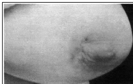
Figure- 2 : A large tender mass was felt in the inner half of the left breast, and a sinus tract was present near the nipple.

Breast TB was first defined by Sir Astley Cooper in 1829 as a rare form of extra pulmonary TB. 1 Breast TB is a very rare disease and constitutes only 0.025-1.04% of breast diseases 2,3 . It is more frequently encountered in developing countries in Africa and Asia. 4,5 Presentation of breast TB is variable and may be confused with other disorders. 6,7 FNAC is the most extensively used initial invasive method for diagnosis of breast TB. 8,9 and the gold standard diagnostic tool for breast TB is often misdiagnosed as a pyogenic abscess or carcinoma of breast, both clinically as well as radiologically especially if well-defined clinical features are absent. 10