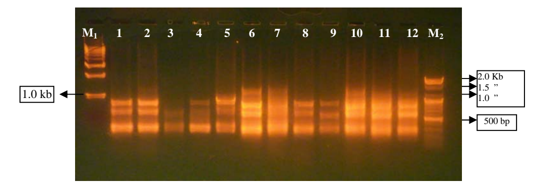
Figure 1: RAPD profile of 12 potato varieties using primer OPX-07. Lane: 1. Cardinal; 2. Diamant; 3. Granola; 4. Lady Rossetta; 5. Sagita; 6. Courrage; 7. Asterix; 8. Felsina; 9. Multa; 10. Provinto; 11. Petronige; 12. T.P.S. 1; M_1 = Molecular marker 1kb (B.G. Nei, India) and M_2 =100bp (Bioneer, Korea)