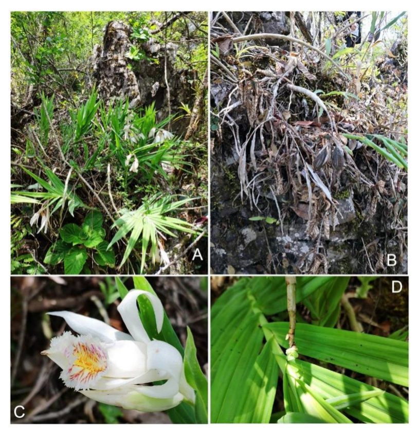
Fig. 1. Thunia alba collected in Xishuangbanna, Mengla, 1000 m high: A. Flowering plant in July at the beginning of the rainy season. B. Fruiting plant at the end of the rainy season in October. C. Flower showing lip with yellow centre and red/purple stripes on the margin. D. Adventitious plantlet formed on an old stem's node.

half strength (half MS) as well as with different concentration of salts (major salts in \frac{1}{2} strength and minor salts and organic components in full strength). Three per cent sucrose and 0.8% agar were added to each medium. pH was adjusted to 5.8 by adding 0.1N NaOH or 0.1N HCI. Each medium was autoclaved at 121°C for 20 min. To study the effect of cytokinin in promoting the germination and growth of the seeds and protocorms authors also prepared MS with different concentrations of added cytokinin. Coconut water (CW) (10, 20 and 30% v/v), BAP (0.044, 0.44, 4.4 and 22.0 \mu M) and Kn (0.046, 0.46, 4.6 and 23.0 \mu M). Seeds were then transferred to the sterile media under laminar flow