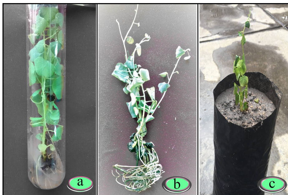
Fig. 2(a-c). In vitro rooting of regenerated shoots and hardening of Cissampelos pareira . (a) Elongation of roots from shoots. (b) Adventitious shoot with elongated rooting system. (c) Hardening of a tissue cultured plant in earthen pot containing soil and vermiculate mixture (1:1) under greenhouse condition.

and creamish colour calli were induced in combination of auxin and cytokinin. Such activity due to the effect of auxin on chlorophyll pigment development (Vigas et al. 2007). The nodal explants of Cyclea peltata inoculated on MS supplemented with NAA + BAP and NAA + Kn maximum callus induction was observed (Manasa et al. 2017). The increase in the auxin concentration resulted in the change of colour of callus from greenish to dark brownish, compact and hard. This is in conformity with prior report in Ipomea aquatica (Prasad et al. 2006). If the phenolic compounds increases that leads to accumulation in the cytoplasm of cell, it undergoes oxidation and polymerization and oxidized products appear brownish/black colour (Lukas et al. 2000).