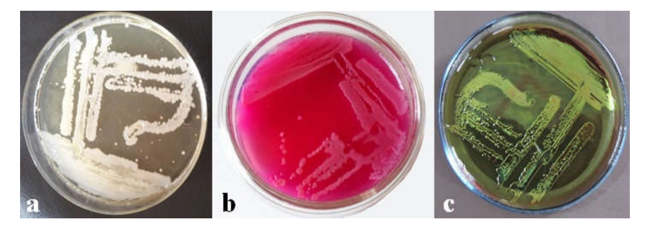
Figure 3. Isolation of bacteria in selective media like Staphylococcus media no.110 (a), MacConkey agar (b) and EMB agar (c).

3). The bacterial isolates grown were E. coli , Staphylococci , Pseudomonas , Kleibsiella , and Bacillus species (Figure 4 and Table 4).