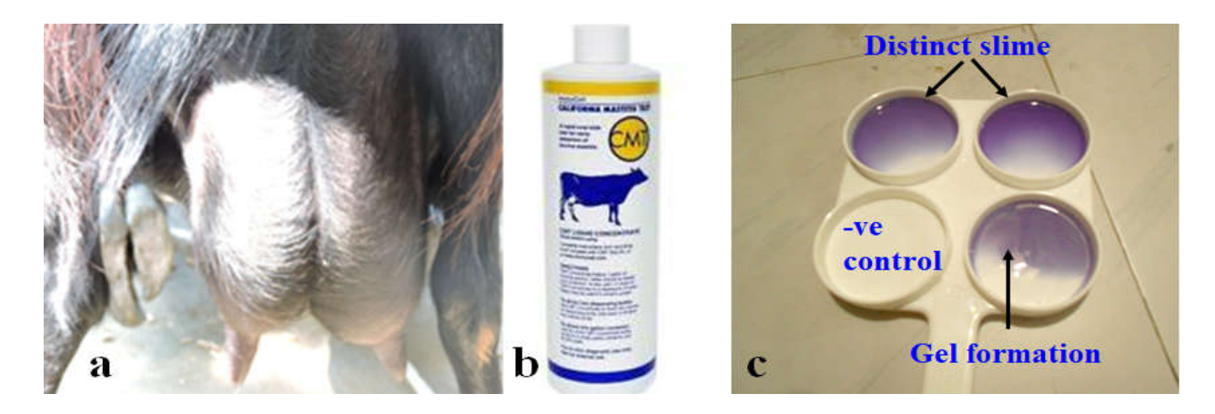
Figure 1. Mastitic udder as seen during examination of lactating goat (a). The CMT test kit used (b) and the results of CMT (c) as obtained during examination of caprine milk.