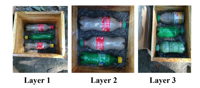
Figure 1. Making plastic bottle brick filled cement mortar cubes using nine 500ml bottles.

cement mortar cubes. The cement mortar for the cubes were made of 1:3 (Ordinary Portland Cement: sand)by weight with a water cement ratio of 0.6. A 2 cm thick layer of mortar was placed in the mold which was compacted with 20 even blows of the tampering rod. Once the first layer had been compacted, three same sized (500ml) sand filled plastic bottles were placed on this first layer of mortar. Then another layer of mortar is placed in the mold covering the first layer of bottles evenly. Approximately 10 blows of the tampering rod were given. The second and third layers of bottles were placed similarly with cement mortar in between the bottles. The step by step process in which a total of nine bottles are inserted into the cube mold is shown in Figure 1. A second set of cubes were prepared in the same way but with twelve 500ml bottle bricks. Figure 2 shows the step by step process.