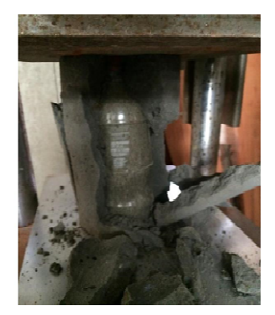
Figure 4. Plastic bottle filled cylinder during compressive strength test and after complete failure.