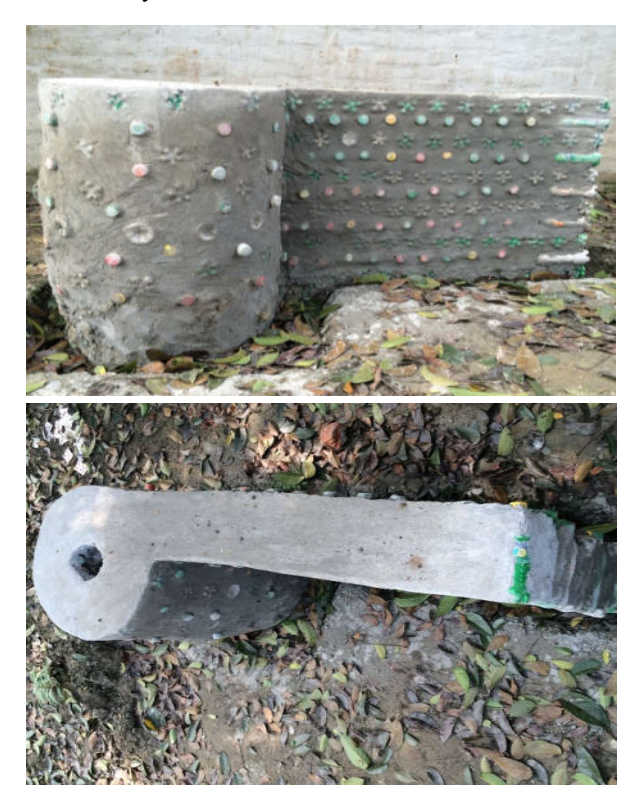
Figure 8. (i) A column and part of a wall constructed with plastic bottle bricks; (ii) View from the top of the column and the wall.

Figure 8is the view of the column constructed with the sand filled bottle bricks and the part of the wall. A complete house could not be built due to lack of available space and time, but as figure 8 shows, columns and walls can easily be constructed with the bottle bricks made in the laboratory. Depending on the purpose and size of the construction, different sized bottle bricks having varying strengths can be used. Even bottle brick filled cylinders and cubes can be used as building blocks to construct these columns and walls as necessary.