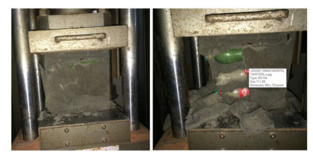
Figure 6. Plastic bottle filled cubes during compressive strength test and after complete failure.

Once the cubes underwent 28 days curing, their compressive strength was tested using the Universal Testing Machine. Figure 6 shows the cubes being tested and the cubes at failure.