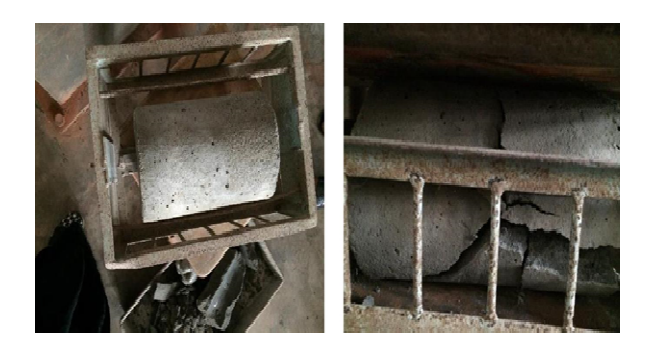
Figure 5. The plastic bottle brick filled cylinder assembled for split tensile strength test and the cylinder after failure.

The cylinder is positioned to ensure that lines marked on the end of the cylinder are vertical and the projection of the plane passing through these two lines intersects the center of the plate. The load is applied without shock and was increased continuously at the rate to produce a split tensile stress of approximately 1.4 to 2.1 N/mm<sup>2</sup>/min, until no greater load can be sustained. The maximum load applied was recorded. Figure 5 shows the assembly and the failure after the maximum load had been applied.