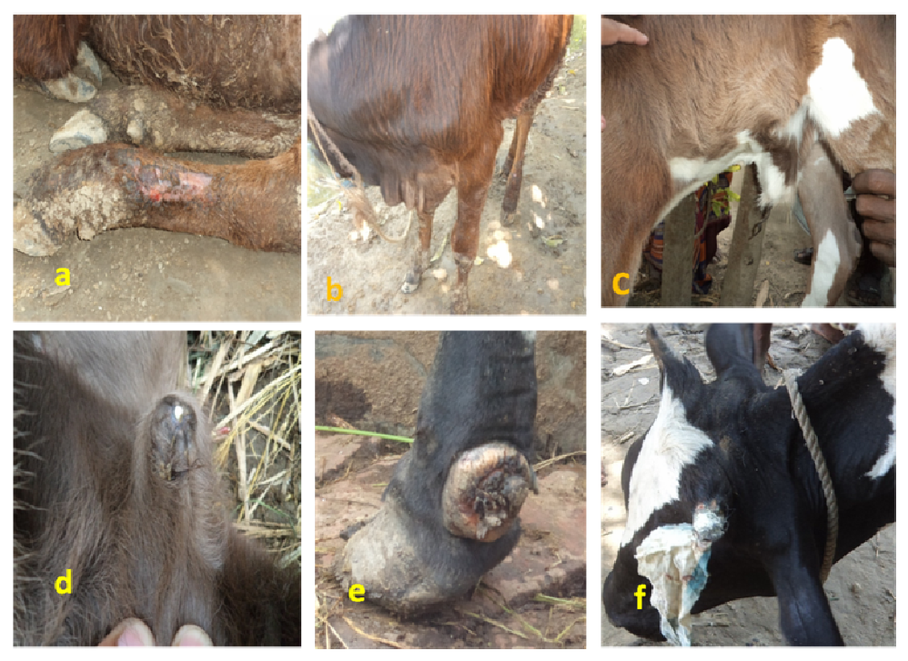
Fig. 5. a) Wounds in calf, b) arthritis in a bull, c) umbilical hernia in calf, d) naval ill in calf, e) maggot infestation and f) horn affection in cow