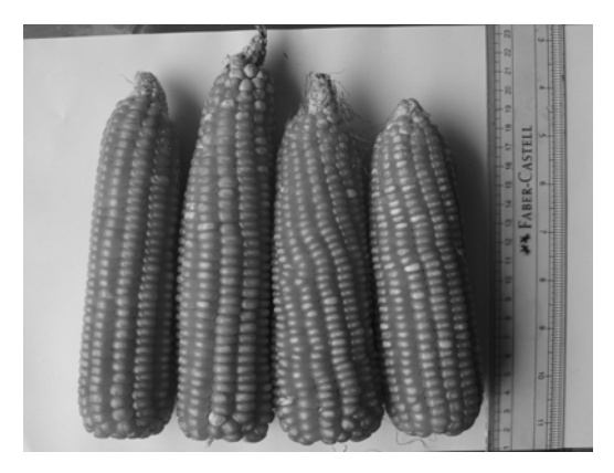
Plate 5. Healthy matured maize cobs