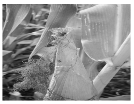
Plate 2. A boring hole made by corn earworm