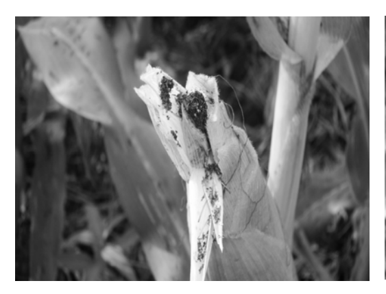
Plate 3. Deposition of earworm faecal matter deposition on maize cob favouring secondary infection