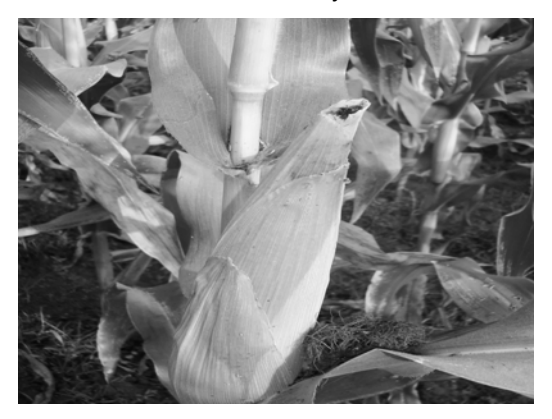
Plate 1. An earworm infested maize cob

consumption. Under extreme cases, the grains rot, the ears gave out foul smell and the whole cobs loosen its utility as animal feed.