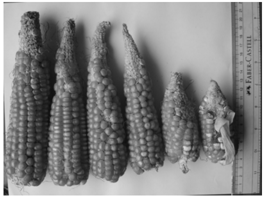
Plate 6. Matured maize cobs after infested