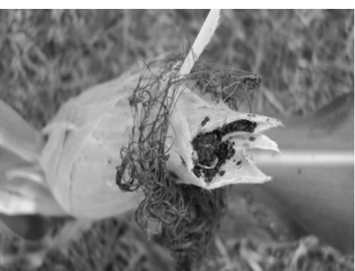
Plate 4. Heavy deposition of faecal matter on maize cob as moist pellets