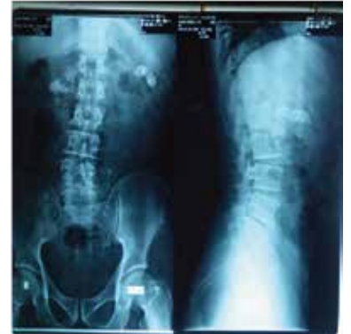
Figure-1: Plain x-ray abdomen in erect posture investigations are Complete blood A/P and Lateral view. Showing radio-opaque

Patient with pancreatic calculi presents usually with characteristic abdominal pain, associated with vomiting. A plain x-ray of abdomen is sometime enough to diagnose the case. There are radiopaque shadows present at the level of body of L1-L2 or on either side. Other count, Blood sugar level, Serum shadows of pancreatic stone. creatinine, Blood grouping, Serum