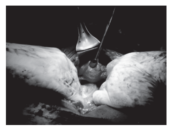
Figure-2: Uterus at the lower abdomen.

Total abdominal hysterectomy with excision of the tumour (Fig-3) was done. Abdomen was closed with a drain. His external genitalia were further examined. Penis and scrotum were well developed, scrotum contains soft tissue like structure, no testis was found. Specimen sent for histopathological examination. He was diagnosed as a case of PMDS.