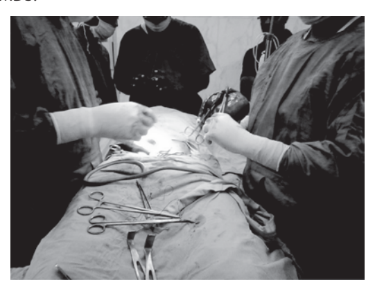
Figure-3: Specimen of tumour after resection.

Total abdominal hysterectomy with excision of the tumour (Fig-3) was done. Abdomen was closed with a drain. His external genitalia were further examined. Penis and scrotum were well developed, scrotum contains soft tissue like structure, no testis was found. Specimen sent for histopathological examination. He was diagnosed as a case of PMDS.