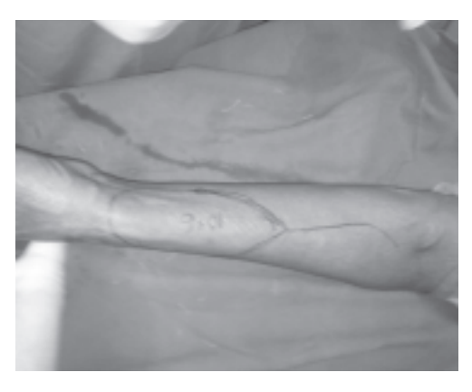
Fig 3: Marking of the required flap size