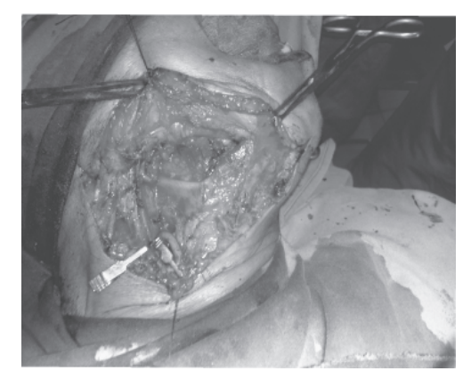
Figure 2: Exposure of the recipient vessels