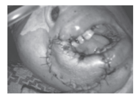
Fig 5: After reconstruction of the excised lesion with RFFF