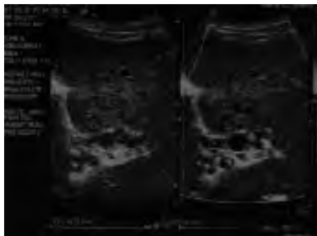
Figure 2: Color Doppler portal venous system