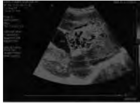
Figure 3: Follow Up Doppler after anticoagulation

in PV. The mutation is present in 90-95 % of PV patients and in approximately 50 percent of Essential Thrombocytosis and IMF (Idiopathic Myelofibrosis) patients 1 . Mutation in the gene for Janus Kinase 2 (JAK2V617F) on chromosome 9p24 (4-7) has gained popularity as a noninvasive diagnostic tool 2-4 . The major symptoms related to hypertension and vascular abnormalities are caused by the increased red cell mass. An episode of venous or arterial thrombosis such as deep vein thrombosis, MI or stroke may be the first manifestation in about 25% cases. Mesenteric, hepato-portal or splenic vein thrombosis should always raise suspicion of PV as a possible cause 18 .