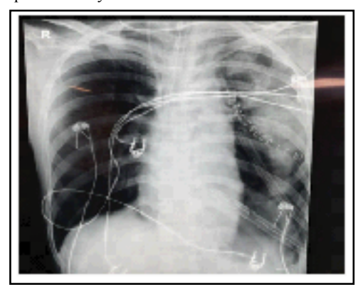
Figure 5: postoperative Chest X-ray.

The subsequent postoperative period of this patient was satisfactory (Figure 5). The patient was discharged on 10<sup>th</sup> postopearative day with stable condition.