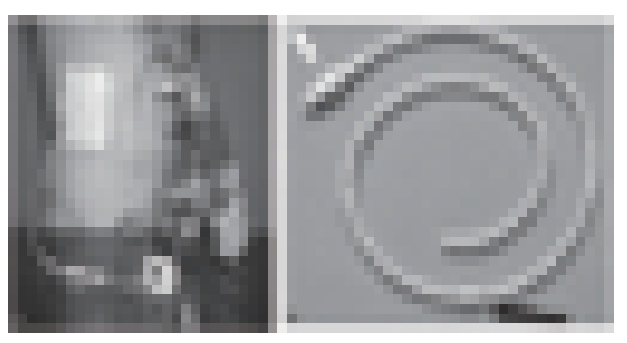
Figure 6: PleurX catheter. A, Patient connects the PleurX catheter to a bottle for self-drainage. B, Close-up of the catheter. Note the one-way valve mechanism (white arrow) and Velcro cuff to provide tissue ingrowth (black arrow).

It is an effective but invasive method for those who have failed to respond to other forms of treatment for treating malignant pleural effusions. Complications may include haemorrhage, empyema, and cardiorespiratory failure (operative mortality rates of 10-13%). The advent of video assisted thoracic surgery (VATS) has enabled parietal pleurectomy to be performed without a formal thoracotomy.<sup>43</sup>