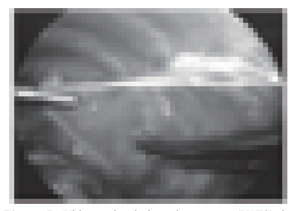
Figure 7: Video-assisted thoracic surgery (VATS) image parietal pleurectomy. L, Lung; P, parietal pleural peel.

Figure 6: PleurX catheter. A, Patient connects the PleurX catheter to a bottle for self-drainage. B, Close-up of the catheter. Note the one-way valve mechanism (white arrow) and Velcro cuff to provide tissue ingrowth (black arrow).