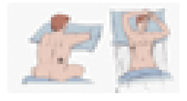
Figure 4: A, Common patient position for insertion of a thoracentesis needle or catheter. Posterior approach allows access to the most dependent (posterior pleural) sulcus to allow maximal drainage of nonloculated fluid. B, Lateral patient positioning for thoracentesis or chest tube placement is also useful for effusions with large lateral collections of

Thoracentesis confirm the diagnosis of pleural effusion. It is usually preferable to attempt drainage of as much pleural fluid as possible. Physical examination can guide a pleural tap. Ultrasound or other imaging can optimize needle or chest tube placement for effusion drainage in more complex situations. This is particularly useful for a small effusion or pleural disease of long duration complicated by lung consolidation or pleural loculation. Although marking of the area of "deepest" fluid is useful, it is important to perform the thoracentesis with the patient in the same position as during the imaging. There are no absolute contraindications. Relative contraindications include a minimal effusion (1 cm in thickness form the fluid level to the chest wall on a lateral decubitus view), bleeding diathesis, anticoagulation, and mechanical ventilation. There is no increased bleeding in patients with mild to moderate coagulopathy or thrombocytopenia (a prothrombin time or partial thromboplastin time up to twice the midpoint normal range and a platelet count of 50,000 /ml) However, patients with serum creatinine levels of 6.0 mg/ dl are at a considerable risk of bleeding. Important complications of thoracentesis include pneumothorax, bleeding, infection, and spleen or liver laceration.17