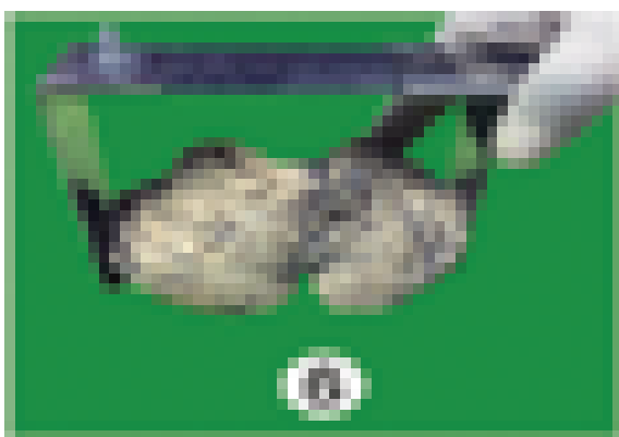
Fig 1: Photograph Showing Procedure of Measurement of the Transverse Diameter of the Cerebellum