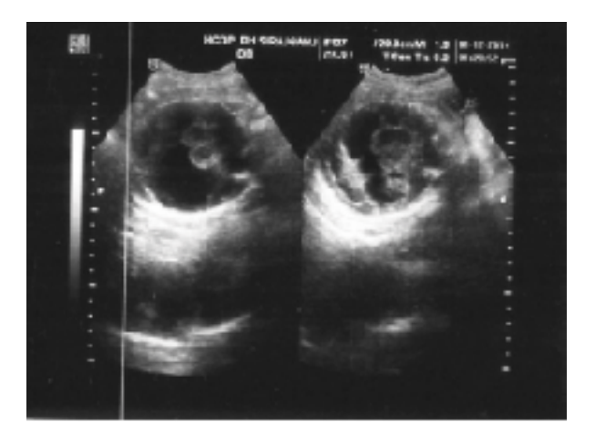
Figure No. 4: Coronal scan of foetal head of Alobar holoprocencephaly showing mono ventricle with fused thalami and absence of septum pellucidum, falx cerebri and interhemispheric fissure.

This case was diagnosed as a case of semi lobar holoprocencephaly. In another case, septum pellucidum, falx cerebri and interhemispheric fissure were absent. Ventricle was monoventricular in appearance and thalami were fused (Figure 3 and figure 4).