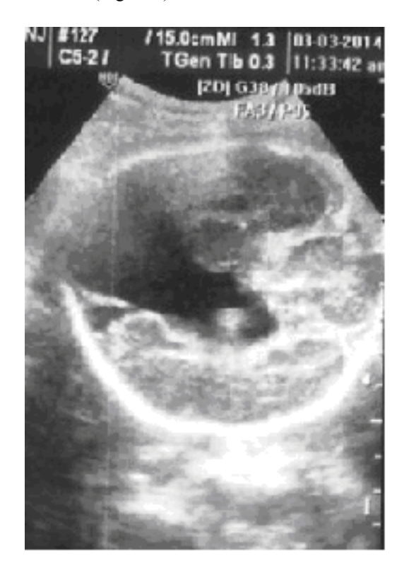
Figure No. 2: Coronal ultrasonography of foetal head of semi lobar holoprocencephaly showing absence septum pellucidum in brain with partially formed falx cerebri, interhemispheric fissure.

Occipital horn was rudimentary and thalami and basal ganglia were partially separated (Figure 2 and Figure 3). The spine, thoracic cage, heart, and limbs were sonologically normal. The posterior fossa structures were normal (Figure 3).