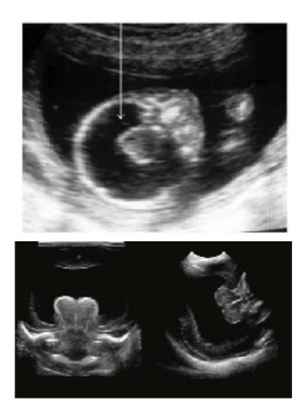
Figure No. 6: Coronal ultrasound image showing the fused thalami in the centre and large monoventricle (thick white arrow). The amniotic fluid around the fetus is normal in quantity.