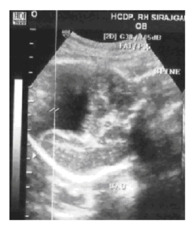
Figure No. 1: Ultrasonographic Scan of foetal head showing large dorsal interhemispheric cyst in semi lobar holoprocencephaly.

Two pregnant women with around 33-34 weeks of gestation were reported to Gynaecology and Obstetrics OPD of North Bengal Medical College Hospital, Bangladesh for last trimester antenatal checkup. They were from shoal area from the bank of river Jamuna. Both parents were healthy and the marriage was nonconsanguineous. There was no family history of birth defects in both cases. They were primigravida with around 23-25 years of ages. None of them had previous antenatal check up. Both of them had normal course of pregnancy. On examination, they were normotensive, mildly anaemic, non-icteric. On per abdominal examination, fundal height corresponded to 30 weeks of pregnancy. With this findings they were advised for CBC, RBS, Blood Grouping and Screening for HbsAg and ultrasonography of pregnancy profile. Blood chemistries were unremarkable. Ultrasounds of pregnancy profile were done at Department of Radiology and Imaging. It was observed in first case that septum pellucidum was absent in brain with partially formed falx cerebri, interhemispheric fissure with presence of large dorsal interhemispheric cyst (Figure 1).