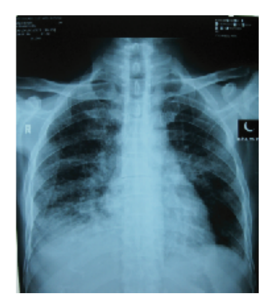
Fig 1: Chest X-ray showing patchy opacities, suggestive of Tuberculosis.

Routine investigations revealed mild anemia (Hb 11 g/dl), leucocytosis (WBC 12.6 G/L) and a high ESR (49). Chest X-ray demonstrated inhomogeneous patchy opacities of both lung fields, more on right lower zone, consistent with tuberculosis (Figure 1).