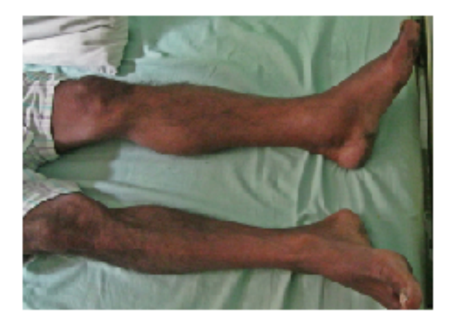
Fig-3: Left limb deep venous thrombosis. (Photo taken with permission)

Sputum was negative for acid-fast bacilli, and MT was positive. Other investigations results normal hepatic, renal and thyroid function, negative viral screening test, mild hyponatremia (132 mEq/L). First line Anti Tubercular Therapy (ATT) with 'Rimstar 4FDC' along with steroid (Prednisolone) was started. After ten days patient again presented complaining of pain and swelling in his left limb for 4 days. Vascular ultrasound revealed femoro-popliteal thrombosis. He was put on low-molecular- weight heparin and warfarin on the same day. 5 days later his symptoms was improved and as target INR was achieved, he was discharged with maintaining dose of warfarin.