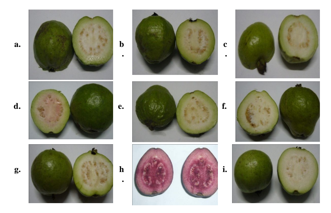
Fig. 1. Longitudinal section of guava varieties (a) Apple (b) Bombay (c) Chineese (d) Jelly (e) Kashi (f) Kazi (g) L-49 (h) Poly and (i) Thai

Morphological characterization: Morphological characteristics of twelve varieties of guava have been presented in (Table 3) such as length, width, fruit color, shape, seed producing rate, taste etc. Height of the tree of Kazi and L-49 vary from 3.9 m to 2.3-3.4 m, Kashi is tallest among twelve varieties (5.2m). All the varieties except Poly are green to light green in color, L-49 has primrose yellow and variety Poly is reddish in color. Fruits of four varieties (Chineese, Thai, Poly and Local-2) are round and other five varieties (Jelly, Bombay, L-49, Local-1, local-3) are rounded ovoid in fruit shape. Apple, Kashi and Kazi are spherical, ovoid and globose in shape, respectively. Fruits of thai variety contains less numbers of seeds. High amount of seeds is observed in L-49. Longitudinal section of fruits were presented in Figure 1. Only Poly is red fleshed guava. Jelly guava has pinkish colored flesh and sour taste. Kazi variety is considered as the most popular commercial variety in Bangladesh.