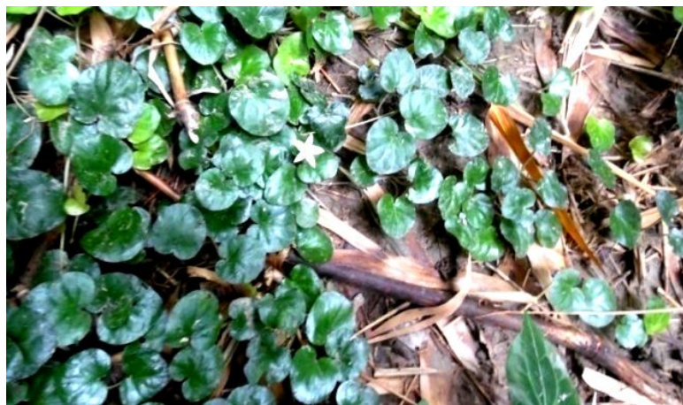
Fig. 1. Geophila repens in a natural habitat

Rondeletia repens L. Syst. Nat. (ed. 10) 2: 928 (1759); Geocardia cordata (Miq.) Standl., Contr. U.S. Natl. Herb. 17(5): 445 (1914); G. repens (L.) Baker f., Bekn. Fl. Java , 144 (1956); Geophila gracilis (Ruiz and Pav.) DC., Prodr. , 4: 537 (1830); G. herbacea (Jacq.) K. Schum., Nat. Pflanzenfam. 4(4): 119 (1891); G. reniformis D. Don, Prodr. Fl. Nepal , 136 (1825); Psychotria gracilis Ruiz and Pav., Fl. Peruv. , 2: 63, t. 211, f. C. (1799); P. repens (L.) L., Amoen. Acad. , 5: 377 (1759).