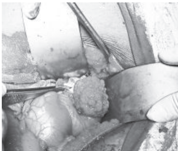
Fig. 2: Peroperative view of duodenal Tubulo-Villous adenoma