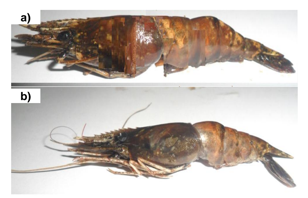
Plate 1. Identified prawns from the DNA barcode.(a) Macrobrachium asperulum(Mag. x 0.8)(b) Macrobrachium nipponense(Mag. x 0.7)

Table 1. Percentage closeness of the identified species in relation to GenBank sequence.