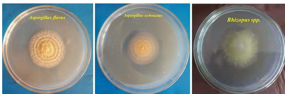
Fig. 2. Inhibition of zone of fungal growth by the flavones 8 .

* = Significant inhibition values; ** =Standard antibiotic nystatin (50 \mu\text{g/disc} ); dw = Dry weight; NI = No inhibition. NI was observed for control DMSO.