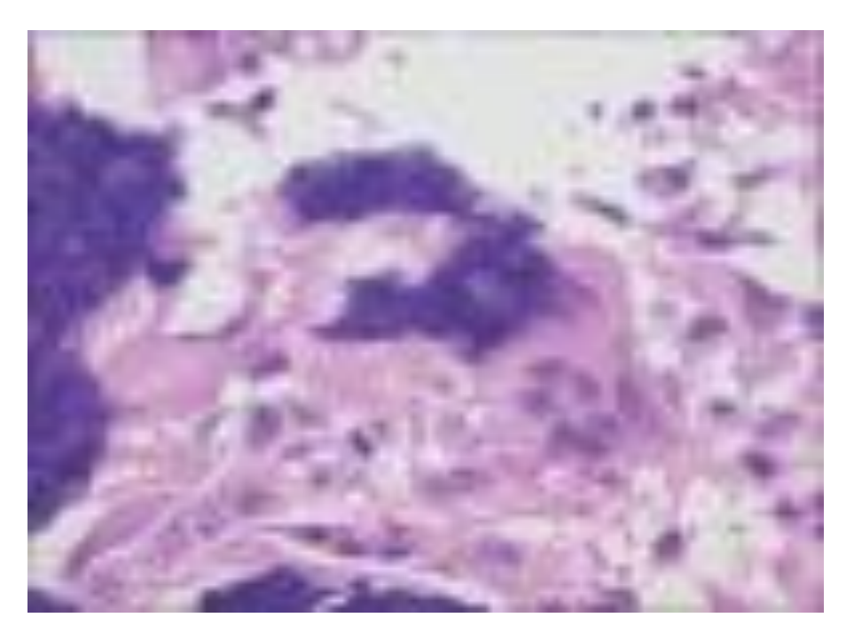
Figure 2: Various stages of maturation of basaloid cells into shadow cells seen (H and E, ×400)

Figure 1: Photomicrograph showing central area of calcification surrounded by shadow cells. Basaloid cells can be seen in the periphery (H and E, \times 100 )