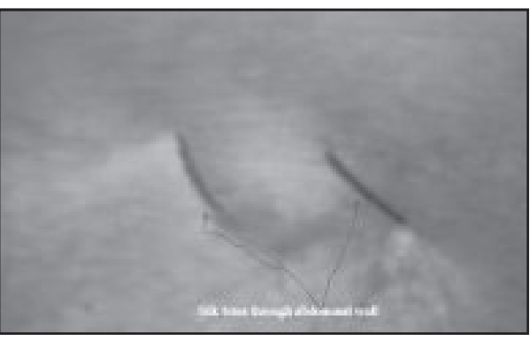
Fig.-2b: Silk bites seen on the inner aspect of abdominal wall

Ovarian Cystectomy: Patient positioning, monitor and ports placement, surgeon and assistant positions were