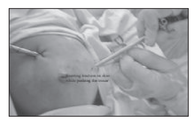
Fig.-2a : Traction on skin during 2<sup>nd</sup> and subsequent port placement

classical HD. For long segment HD, foot-end and head-end of the patient were elevated alternatively and the assistant changed position accordingly from headend to foot-end side. Bipolar cautery was used to burn the meso-colon to create a window before skeletonization of distal colon using monopolar hook cautery. Occasionally 5 mm clips were used to divide the blood vessels between clips. Adequate length of distal colon was mobilized in this manner and CO<sub>2</sub> insufflations shut down before proceeding to transanal dissection. After trans-anal dissection was complete, the already mobilized colon was pulledthrough the anus. Abdomen was distended again with CO<sub>2</sub>. telescope was introduced to see the orientation of pulled-through colon, any herniation of small-gut beneath it and for any bleeding or collection. Then the laparoscope and insufflations were shut down and coloanal anastomosis was done. The ports were closed subcuticularly after fascial closure at right upper quadrant port.