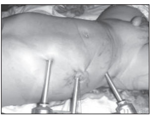
Fig.-1b: Ports placement in long segment Hirschsprung's disease

Hirschsprung's disease (HD): Patients were supine, monitor on the left side and surgeon on the right side of mid-section of patient's body. Assistant stood on the left side of surgeon towards head-end of patient. Three ports were placed: 1st port was at right upper quadrant over right rectus abdominis for telescope. After insertion of 1<sup>st</sup> port and insufflations was done, 5 mm 30° telescope was introduced and length of involved segment was assessed. In classical HD, 2nd port was in right iliac fossa and 3rd port was in left upper quadrant (Fig. 1a). In long segment HD, all three ports were on right side: 1st port in right upper quadrant, 2<sup>nd</sup> port at the level of umbilicus (used for telescope later on) and 3rd port in right iliac fossa (Fig. 1b). The 2<sup>nd</sup> and 3<sup>rd</sup> trocars were placed after applying traction on abdominal wall using four-point silk bites to prevent injuring the intestines (Fig. 2a & 2b). After port placement and insufflations, the left side and foot end of the patient was elevated for