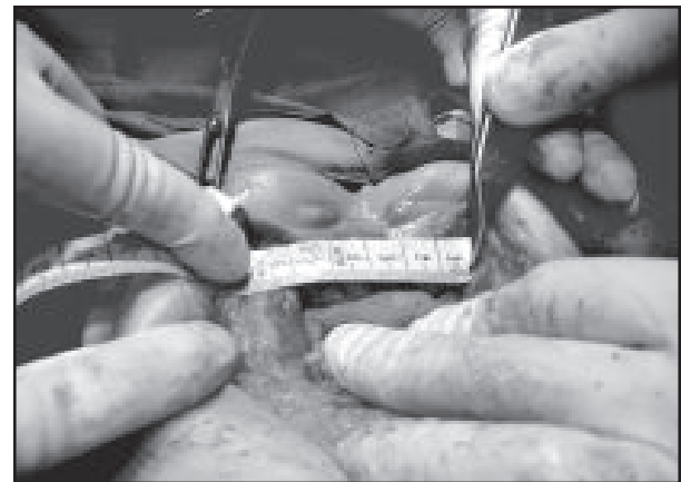
Fig.-2: Per-operative measurement of ISG.