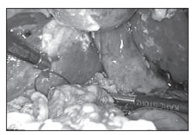
Fig.-2: Repair initiated