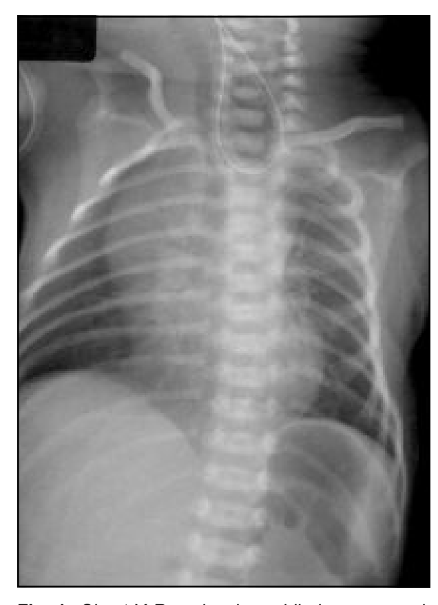
Fig.-1: Chest X Ray showing a blind upper pouch with distal bowel gas indication presence of a tracheo-oesophageal fistula.