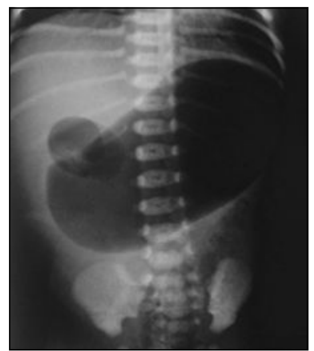
Fig.- 5: Abdominal x ray in Duodenal atresia.

Duodenal and small bowel atresias are identified antenatally through 'double bubble' or triple / multiple bubbles' indication proximal dilated intestines. The mother may have polyhydramnios. The pregnancy is generally uneventful and is allowed to go to term, with normal delivery being the norm. In general a patient with duodenal atresia will need to be fully worked up for chromosomal abnormalities as well as other malformations and or syndromes. Small bowel atresias in general occur in isolation. In particular duodenal atresia may be associated with Down syndrome, where cardiac, renal and large bowel malformations also occur. (VU reflux, and Hirschprung's or Ano-rectal malformations) (Figure 5).