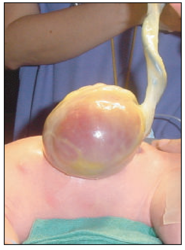
Fig.-6: Omphalocoele with an intact sac. The liver and intestines can be seen under the sac.

strictures or atresias associated with the defect. Primary closure gives the best outcomes, but this is not always possible without causing a devastating increase in intra-abdominal pressure with splinting of the diaphragm, so a staged or silo closure is then preferred <sup>8,9</sup>. Mortality in this group of patients is related to sepsis as well as associated malformations. Babies with Gastroschisis may have short bowel.