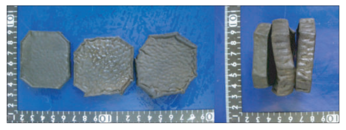
Fig.-3: The foreign bodies.