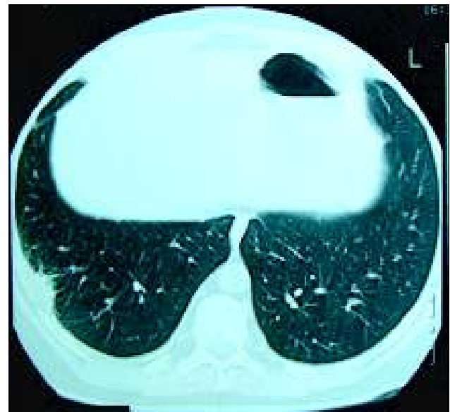
Fig-3: HRCT thorax of case number two showing sub pleural triangular opacity on right side, evidence of lung infarction.

ambulatory and without any risk factor for DVT. On the 2 nd week of treatment he complained of pain both lower limbs starting from the inguinal areas along with swelling. He was admitted for investigation. On the 2 nd day of admission he developed sudden onset of central chest pain, dyspnea with heart rate 120/min, respiratory rate 36/min and blood pressure 60/40mm of Hg. He was diagnosed clinically as pulmonary thromboembolism. Treatment was started immediately with enoxaparin 80 mg/day along with supportive measures, and switched on to warfarin (starting dose 5 mg) with maintenance of international normalized ratio (INR) between 2.5 to 3. His HRCT thorax revealed typical sub pleural triangular opacity with base towards pleura (Fig.-3) suggestive of pulmonary infarction.