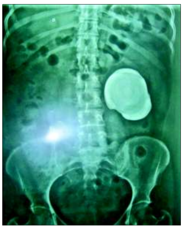
Fig.-1: Abdominal x-ray showing a radiopac image in the left kidney topography.

The pain had increased in the last months and was followed by vomiting and recurrent urinary tract infection. At the physical examination the patient was in good general health, pale, normotensive, with normal cardiopulmonary auscultation, semi globus abdomen, unpainful at palpation and with nor palpable masses. Antibioticotherapy was started with ciprofloxacin, and complementary tests were done. The initial laboratory tests showed Ht 35.3%, Hb 11.2g/