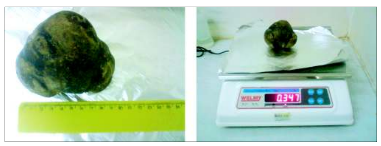
Fig.-2. Giant urinary calculus.

dL, white blood count 11870/iL, platelets 371,000/mm³, urea 27mg/dL, creatinine 0.8mg/dL, potassium 4.1mEq/L, sodium 138mEq/L. The abdominal x-ray showed a large opacity in the left kidney topography (Figure 1). The computed tomography evidenced a giant left ureteral calculus associated with a large ureteropelvic junction dilation and grade III hydronephrosis. An ureterolitothomy was then