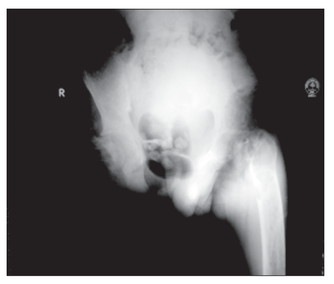
Fig 4: X-ray pelvis with both hip A/P view showing Generalized osteoporotic changes

Multiple lytic lesions noted in left ileal blade and upper femoral shaft.