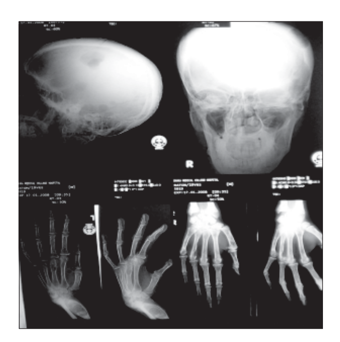
Fig.-2: Multiple lytic lesion in skull & bone resorption in phalanges.