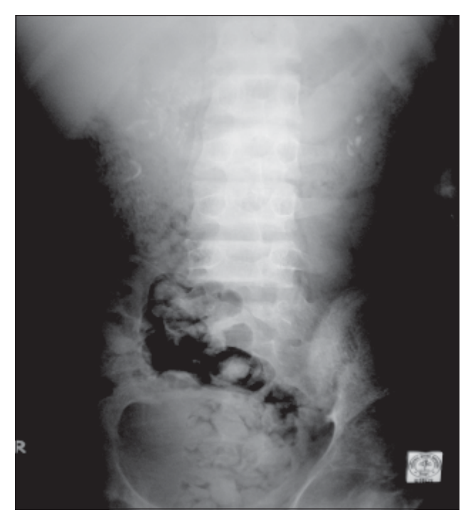
Fig 3: Left sided Renal stone