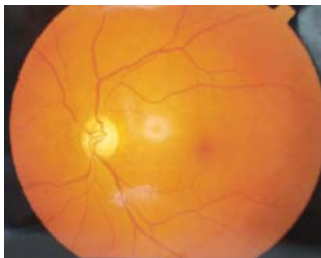
Fig.-2: Fundus photography of the left eye.