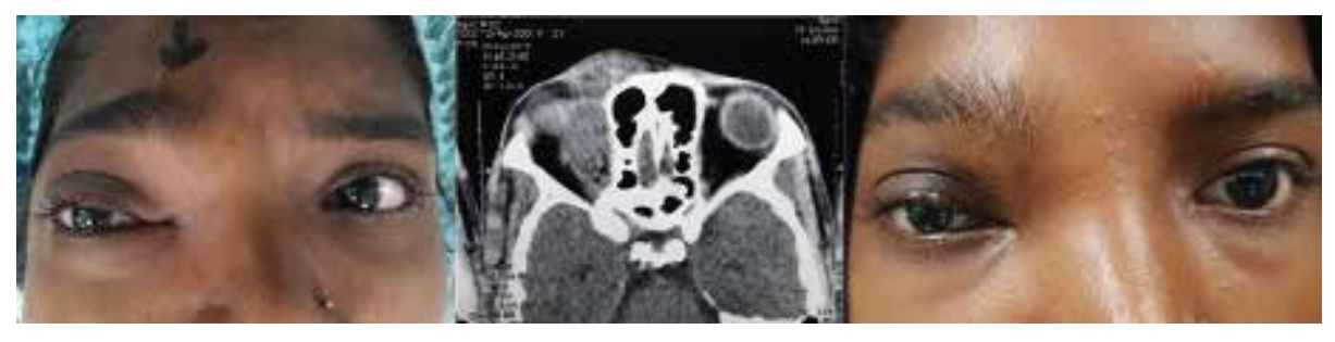
Figure 3 (a-c): a 10-year-old girl presented with right periocular lymphangioma, Axial CT images showing the heterogenous lesion within an internal septation involving the right upper eyelid and extraconal space of the right orbit. Post bleomycin injection resulted satisfactory outcome.

A study reported 13 patients with orbital lymphangiomas who underwent sclerotherapy injection with bleomycin with an average follow-up time of 19.69 months. 92% of patients showed more than 60% reduction in the maximal lesion diameter.2 A study reported on 12 patients treated with bleomycin sclerotherapy, 50% showed complete resolution, and the other 50% showed more than 70% without any systemic and ophthalmic side effects.<sup>15</sup> Hill RH et al. described safe and effective treatment modalities with dual sclerotherapy intralesional sodium drug tetradecyl sulphate and ethanol for macrocystic lesions and injection doxycycline for treating microcystic lesions.10 The efficacy of intralesional injection of OK-432 (Picibanil) was studied on 12 patients with orbital lymphangiomas, 89% of patients presented with regression of tumour size, and 87.5% of patients improved their vision, decreased pain or proptosis in an average of 64 months follow up.<sup>28</sup> The OK-432 intralesional injection is effective alternative sclerotherapy that may require one to four injections over a month to 12