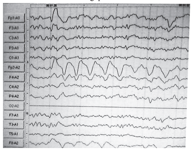
Figure I: EEG showing Frontal Intermittent Rhythmic Delta Activity (FIRDA) where CT-scan Showed Infarction in Right Frontal Lobe

A report of 130 patients from the epilepsy clinic of BSMMU, a public medical university and post-graduate medical center, showed that close to 70% of patients visited indigenous medicine practitioners, exorcists, spiritualists prior to consulting the clinic, only 29% perceived epilepsy as a disease, 50% dropped out from school 58% of whom due to epilepsy and 52% of patients had to change job because of epilepsy. Appropriate antiepileptic drugs are sometimes very costly or unavailable in Bangladesh. The BSMMU study showed 23% of patients found it difficult to continue treatment due to financial problem. Financial factor is likely to partly account for the treatment gap<sup>6</sup>.