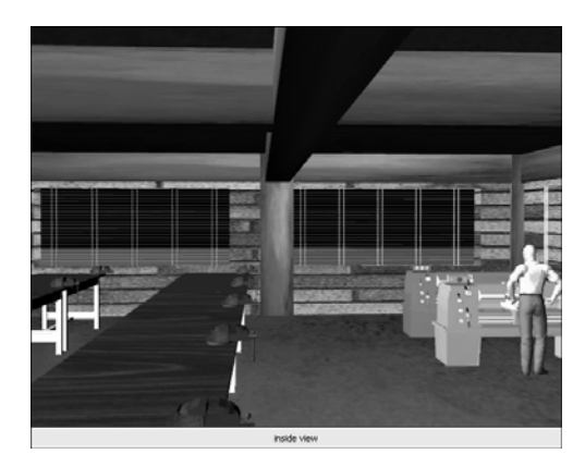
Figure 3: Human walking (Egocentric View).