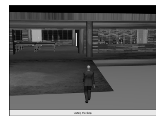
Figure 2: Workshop Entrance.