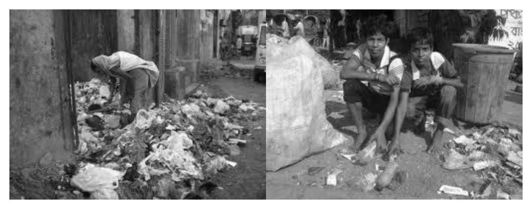
Figure 3: Manual collection of recyclable solid wastes by collectors