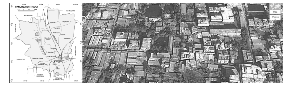
Fig. 1. Map showing the geographical location of Sholokbahar in Chittagong City Corporation

There are 41 wards (administrative areas) in Chittagong City Corporation (CCC). The study was selected purposively at Sholokbahar, ward number 8, under CCC of Bangladesh.