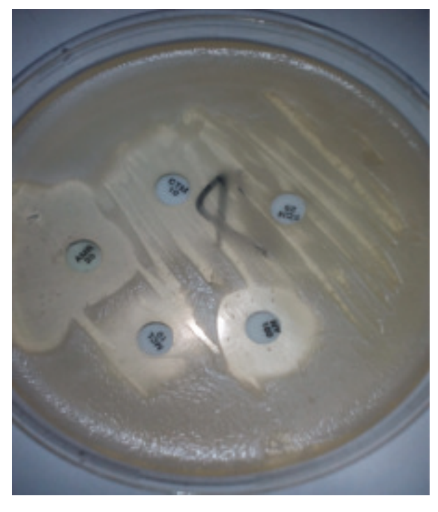
Fig.-2: Antibiotics susceptibility of Candida isolate estimated by agar disc diffusion method.

highest level of sensitivity was observed 31(88.58%) in both clotrimazole and amphotericin B, whereas fluconazole showed the highest 21(60%) level of resistance.