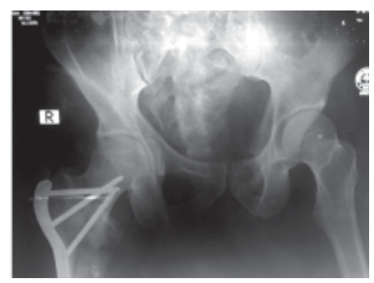
Post operative x-ray on 20/04/2014