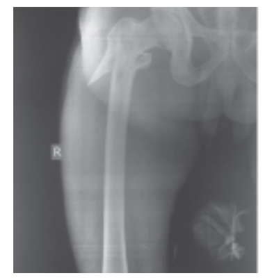
Pre-operative x-ray on 25/ 03/2014