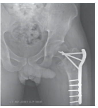
Follow up x-ray on