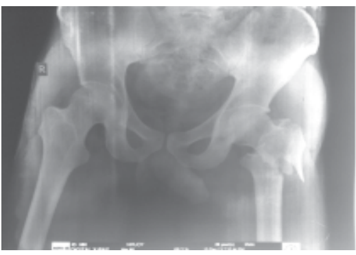
Pre-operative x-ray on 12/10/2013