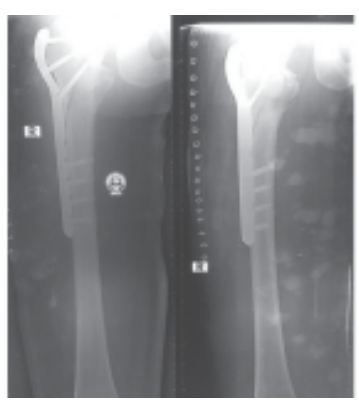
Post operative x-ray on 20/ 04/2014