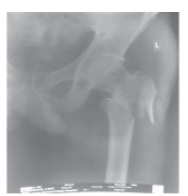
Pre-operative x-ray on 12/10/2013