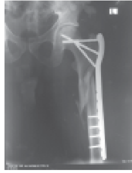
Follow up x-ray on 19/10/2014