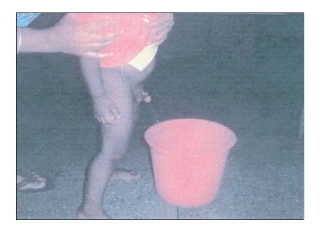
Fig 3 : One patient passing urine normally with straight flow and normal stream