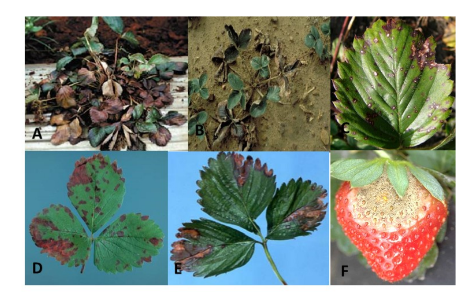
Fig. 3. Phytophthora crown rot disease of strawberry (A), strawberry plant dying from Verticillium wilt (B), strawberry leaf spot symptoms on leaflet (C), leaf scotch on strawberry (D), Pomopsis leaf blight on strawberry (E) and Botrytis fruit rot on mature strawberry fruit (F).