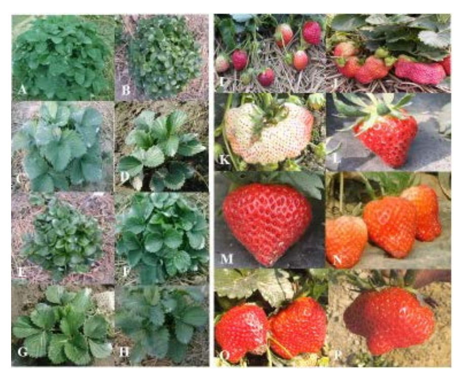
Fig. 2. Different plant types (A-H) and fruit shapes (I-P) showing somaclonal variations.

Among the six strawberry diseases, disease incidences (%) of verticillium wilt and phytophthora crown rot was high (60%) in seven donor parent's viz. AOG, JP-2, JP-3, Camarosa, Sweet Charly, Giant Mountain and Festival but in somaclones it was 15% (Table 5). Other diseases viz. leaf scotch, leaf spot, leaf blight and botrytis fruit rot, disease incidence (%) was high (45-50%) in donor plants but in their somaclones it was low (10%). Most of the plants were severally affected with these diseases during the summer and were perished. There were no plants found resistance to fungal diseases.