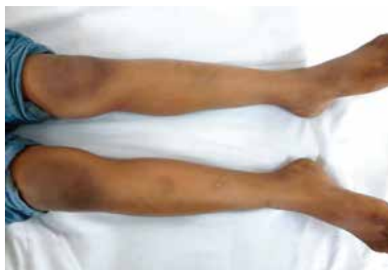
Fig-1: Photograph of the ecchymosis on patient's lower limbs.

of bleeding per rectum for 1 month which was painless and occasionally mixed with stool. The patient developed gradual worsening of generalized weakness and easy fatigability for same duration. There are ecchymosis on different parts of the body present since birth, intermittent in nature, aggravates after minor injury and resolves spontaneously. Patient had history of occasional nasal bleeding since birth which aggravates after minor injury and nose pricking. She has a positive family history of bleeding disorder. She is the fourth issue of consanguineous parents. Her eldest sister died at the age of 17 years due to excessive bleeding, the cause of which was undiagnosed. Her uncles and cousins of both side have no such type of illness. Initially she was evaluated at different hospitals in Chattagram and ultimately was diagnosed a case of Haemophilia B as her lab findings of factor IX assay revealed deficiency. Then she was treated accordingly. As her condition did not improve, she was suspected as a case of von Willebrand Disease at Dhaka Medical College Hospital (DMCH). After that patient was referred to AFIP for further detailed evaluation. There was no history of joint swelling, gum bleeding, bony tenderness or fever. Her bladder habit was normal. On general examination, she was found anaemic with multiple ecchymosis on both lower limb. Systemic examination revealed no abnormality.