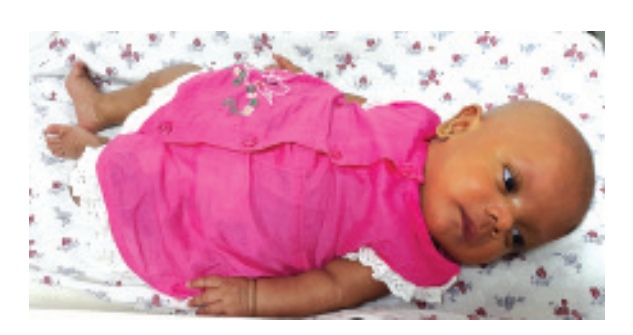
Fig.-4: At the age of 153 days (weight 2811 gm)

She received injections ceftazidime and Amikacin since Day1 and was replaced with Meropenemon Day 8 and continued for 21 days till D 27 (weight 508gm) of her age, when it was changed to Tazobactum and Piperacillin as her condition worsened with an episode of prolonged apnea requiring resuscitation with bag and mask ventilation. Her condition further deteriorated on Day 40 (weight 622gm) and she had an episode of apnea followed by hypoxemia (SPO<sub>2</sub> 40%). This episode also required CPR using Ambu bag. Her antibiotic was then changed to Cefepime and Netromycin. Nasogastric feeding was stopped on Day 41 as she had frequent apneas. She was not mechanically ventilated according to her parents' will. She was gasping and we did not quite expect her to survive. Her condition however, improved the next day and NG feeding was restarted. Netromycin was omitted after 14 days and Cefepime was continued for 21 days till Day 62 (weight 710gm) of her age, then it was changed to Cefotaxime which was continued for another 21 days.