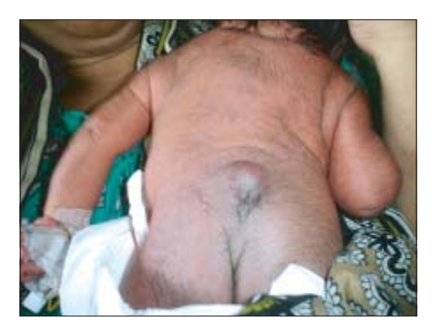
Fig.-2: Showing meningomyelocele on the lumbosacral region of the patient