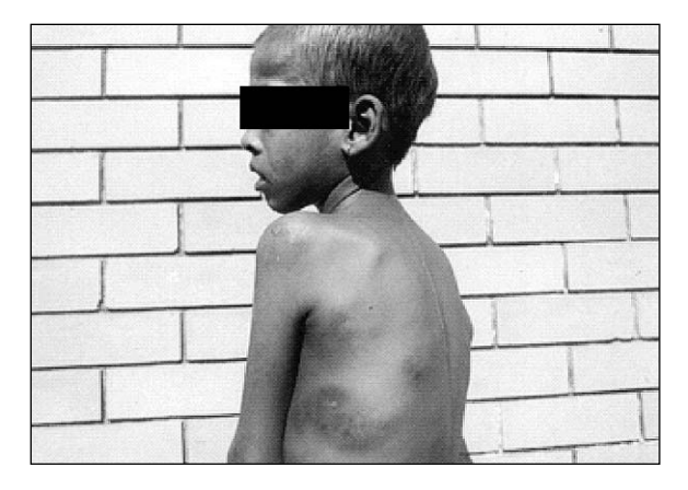
Fig-1: 9 years old boy with multiple erythematous nodules.

A 9-year-old male child, 1st issue of a day- labourer, weighing 21.5 kg, immunized as per EPI schedule admitted into ICMH, Dhaka with the complaints of fever for two years, pain and swelling of multiple small and large joints for one and a half year, non productive cough and difficult breathing for 10 days before admission. The joint pain was not migratory and there was no history of morning stiffness. He had been suffering from repeated attacks of common cold since 2 years of age. He denied any history of trauma or abdominal pain. There was no history of contact with a tubercular patient.