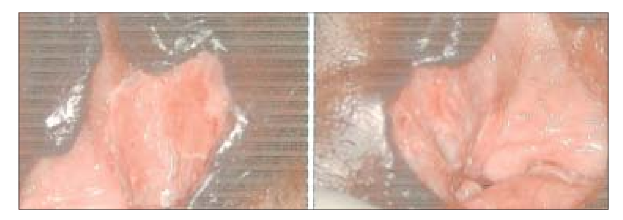
Fig.-3&4: Colposcopic feature of vagina- Bilateral vaginal ulcer with undermined edge.

VDRL, TPHA, HIV Elisa test & HVS with gram staining and culture was done to exclude syphilis, gonococcal, trichomonal and HIV infection. The had ESR patient high (125 mm/hrs)polymorphonuclear leukocytosis with lymphopenia, milliary mottling on chest X-ray, sinus tachycardia on ECG and AFB+ve on sputum culture. Paps cytology reveled inflammatory cells with mild dyskaryosis. Urine samples were negative for AFB. Ultrasonogram of whole abdomen showed no abnormality. Endometrial aspiration cytology and Mantonx test were not done due to presence of active tuberculr lesion. Cervical biopsy report revealed granulomatous lesion with plenty of mononuclear cells and caseation. The patient was referred to the department of medicine of KMCH seeking opinion. The case was diagnosed as bilateral extensive pulmonary TB with concomitant endometrial, cervical and vaginal TB. The patient was treated with anti TB drugs (INH+ Rifampicin+Ethambutol+ Pyrazinamide). After One week of initiation of treatment, Ethambutol was omitted as the patient complained of visual disturbance. After 2 weeks of onset of treatment during follow up, the patient had better look with no P/V discharge and no ulcerative lesion in cervix (Fig-II) and vaginal ulcer was totally disappeared (Fig-V). Patient is still on antitubercular drugs and on regular follow up.