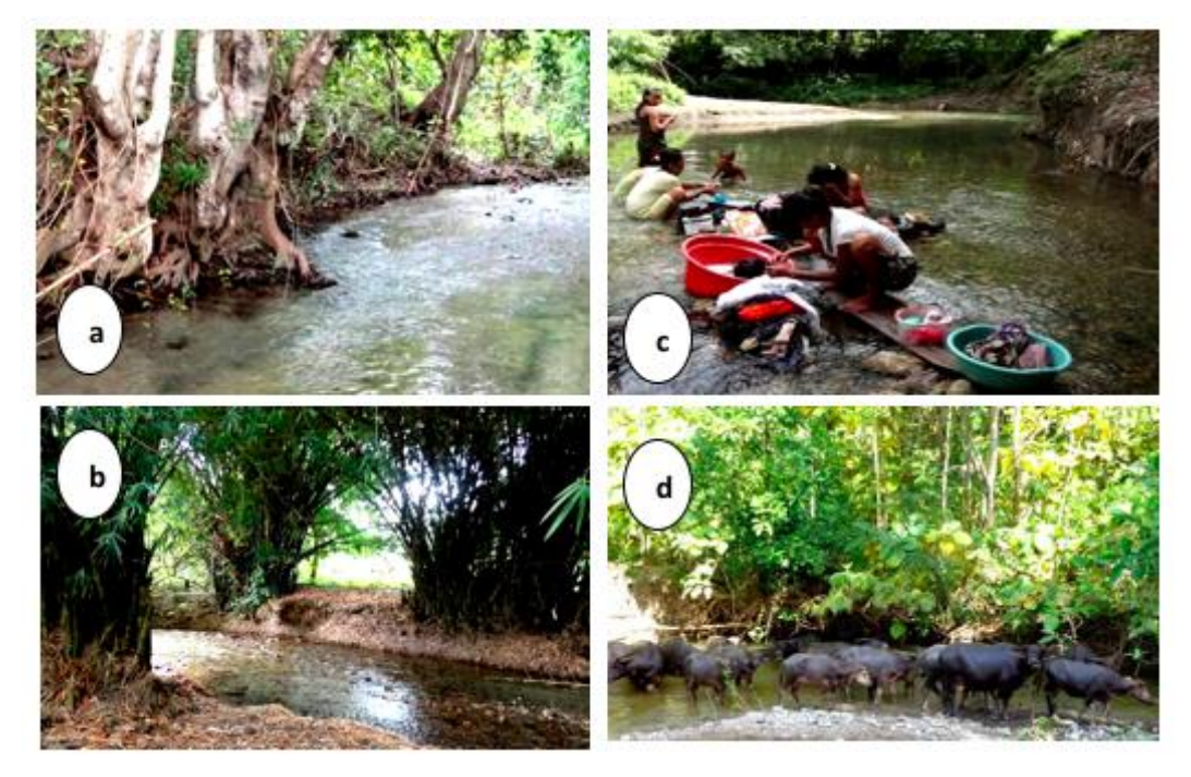
Fig. 7 Trees that are found in river sites (a) Ficus variegata , (b) Gigantochloa atter , (c) activity of the local people who can not escape from springs, and (d) wild cattle also used the spring