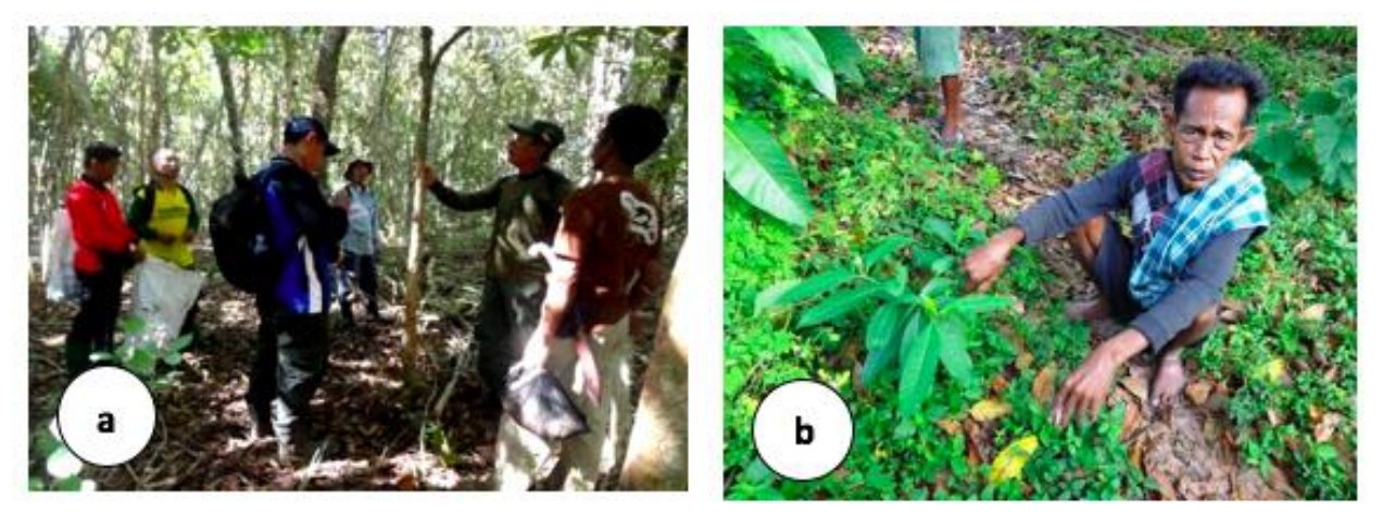
Fig. 2 a) Observation of ethnobotany in the forest, b) Interview with elder people of Brangkuah community who cultivated plants from the forest in their gardens

The following information was reordered 1) Scientific Name (binomial), 2) local name, 3) plant part used, 4) utilization category, 5) the used plant status, and 6) how the plants were used. The data obtained were analyzed descriptively. A literature study was used to know the chemical constituents of plant species based on the latest research. Most of the materials were preserved by making a herbarium specimen to identify the plant species. The herbarium specimen was identified in Herbarium Bogoriense and Purwodadi Botanic Garden LIPI (Indonesian Institute of Sciences). The Plant List (http://www.theplantlist.org/) was used to standardize scientific names.