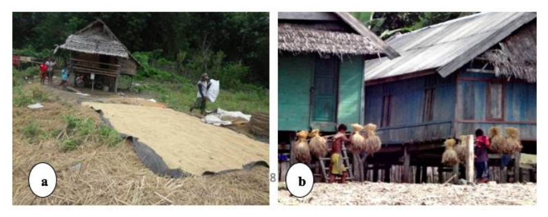
Fig. 5 Activity of brangkuah people to cultivate rice. This location is near to the forest, (a) small house and field its far from they live, and (b) bringing the harvest home