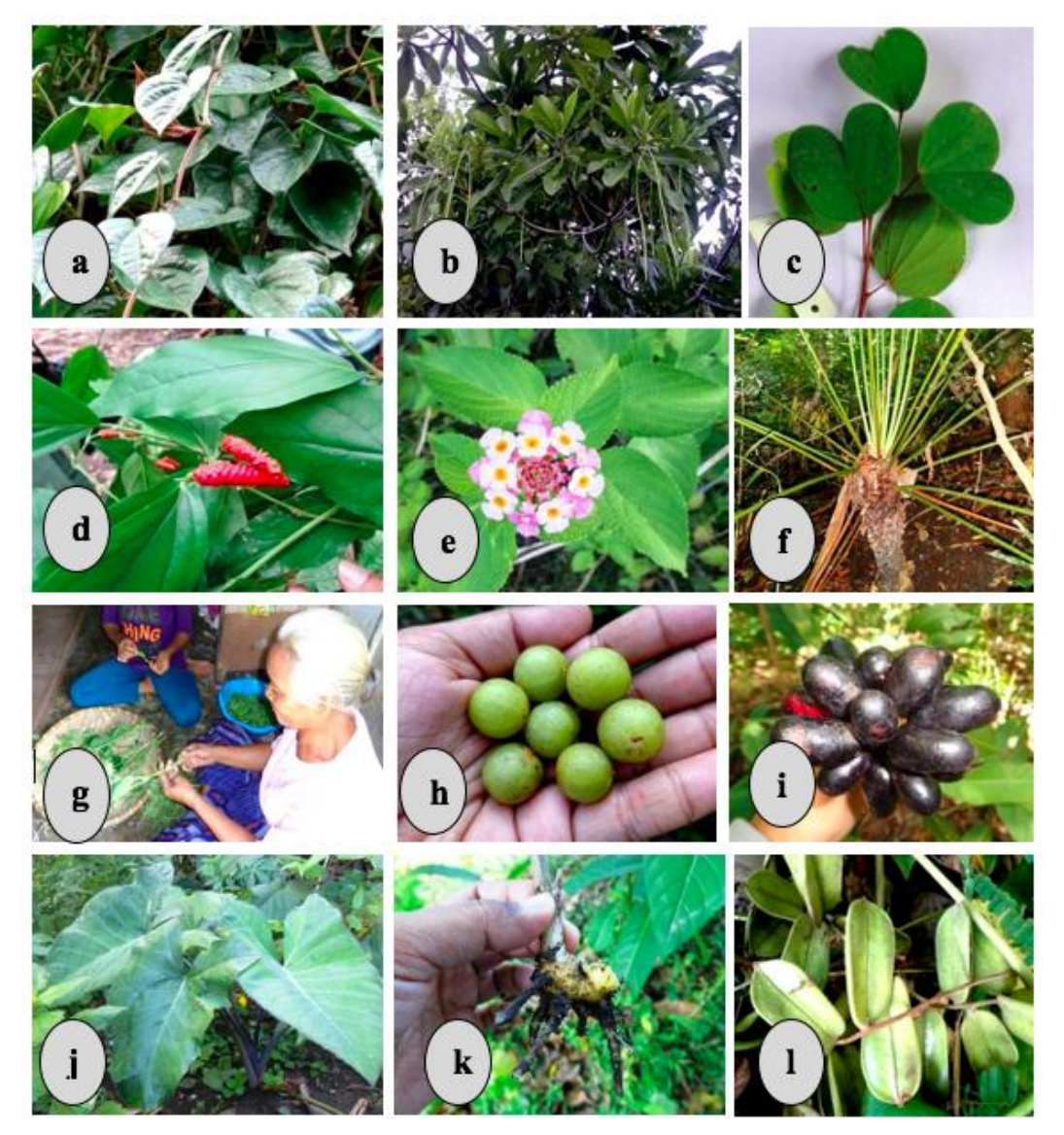
Fig. 3 Useful plants in Brangkuah village: (a) Piper betle, (b) Alstonia spectabilis, (c) Bauhunia purpurea, (d) Piper retrofactum, (e) Lantana camara, (f) Cycas rumphii, (g) Cucurbita moschata, (h) Phyllantus emblica, (i) Alstonia spectabilis, (j) Xanthosoma sagittifolium, (k) Zingiber inflexum, (l) Dioscorea hispida