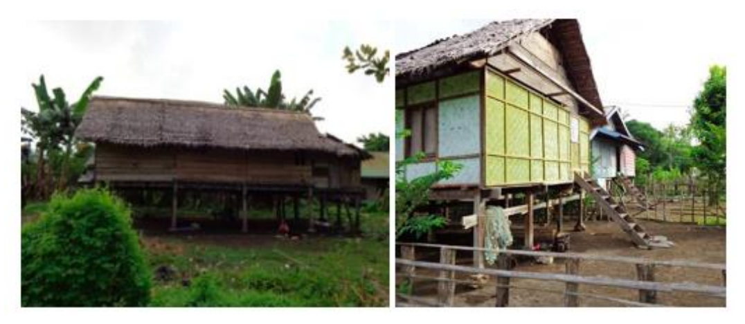
Fig. 6 Traditional house of the Brangkuah community

Fig. 5 Activity of brangkuah people to cultivate rice. This location is near to the forest, (a) small house and field its far from they live, and (b) bringing the harvest home