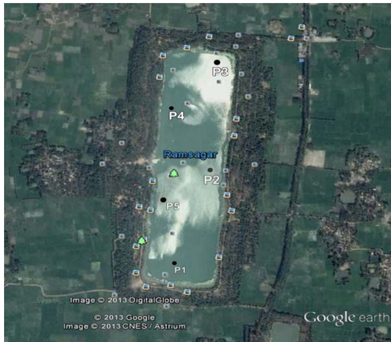
Fig. 1. Five study points of Ramsagar lake in Dinajpur district.

For the purpose of the study, five different sampling points were selected (P1, P2, P3, P4 and P5) inside the lake (Fig. 1). Samplings were done fortnightly for a period of 8 months from January to August 2013. The water samples were collected from five different points in the morning hours between 8.0 am to 11.0 am. Plastic bottles with stopper having a volume of 250 ml each and marked with different point number and sampling date were used for collection of water samples. A digital thermometer was used for water temperature measurement. Transparency was measured with a secchi disc of 20 cm diameter. Dissolved oxygen of water samples were calculated by portable digital DO meter (Lutron, DO-5509). For observing the pH of water samples a direct reading digital pH meter (CORNING pH meter 445) was used. While other parameters such as alkalinity, hardness, phosphate and Chlorophyll-a were estimated in the laboratory of department of Fisheries Management by using standard methods as prescribed by APHA (1992) and HACH kit.